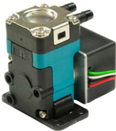
FF 12 DCB / DCB-4